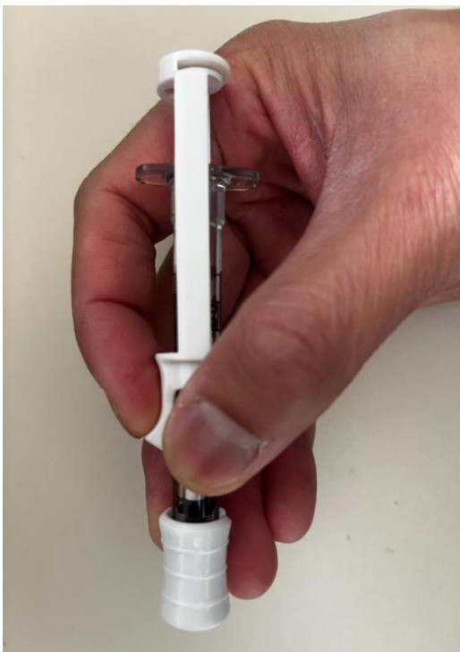
Figure 4: Visual of Pencil Grip, Hand Position 2