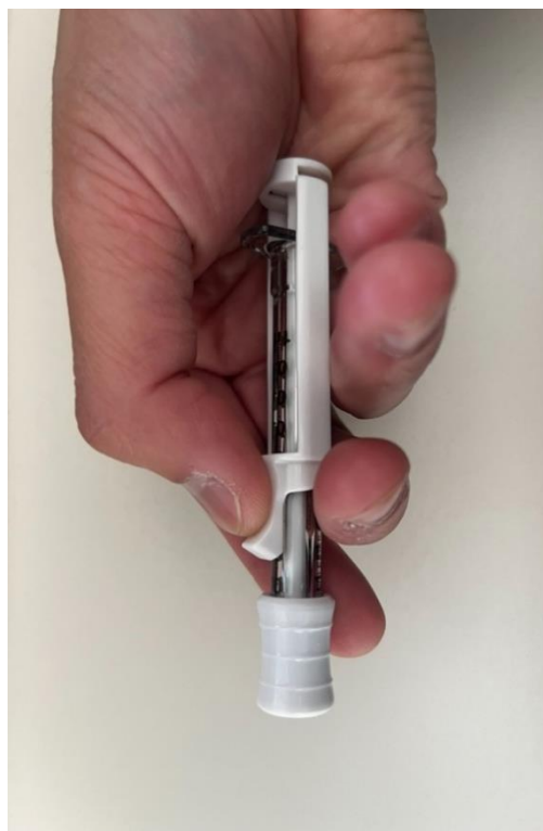
Figure 5: Visual of TV Remote Grip, Hand Position 3