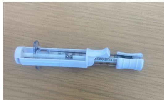
Figure 1: Syringe adapter with the "depressor" to the left and "grip" to the right

The device consists of "depressor" and "grip" units that can be positioned based on surgeon's preferred hand positioning. The two units may be used alone or together based on the surgeon's preference.