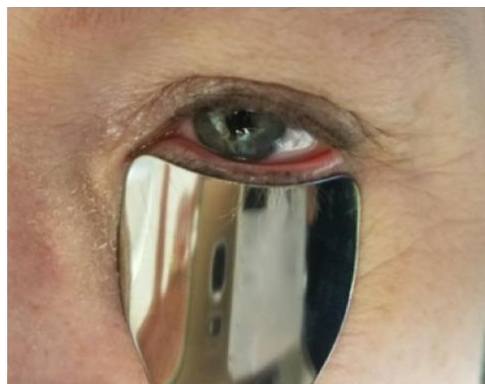
Example of Step 1