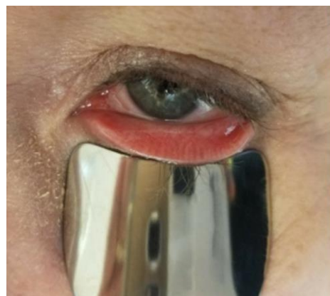
Example of Step 2