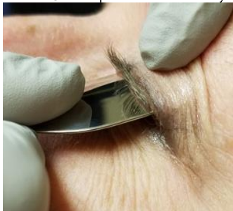
Meibomian Gland Expression of the upper eye lid.